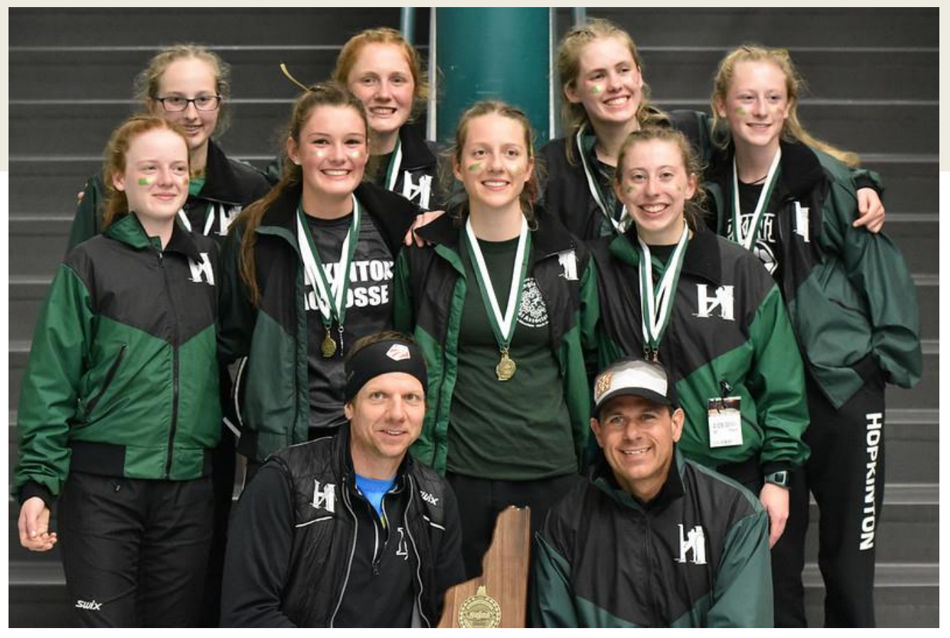
The State Champion Girls Nordic Team (above) with the Runner-up Boys, below!