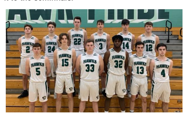
The boys basketball team finished 16-5 and also made it to the semifinals.